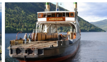
SF AMMONIA World's oldest steam-powered railway ferry, docked at Mæl station.

More information: www.visitrauland.com / www.visitrjukan.com