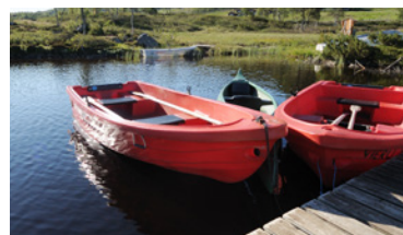
VIERLI Go fishing or canoeing on lake Uvatn, or visit the summer farm with goats and ducks.