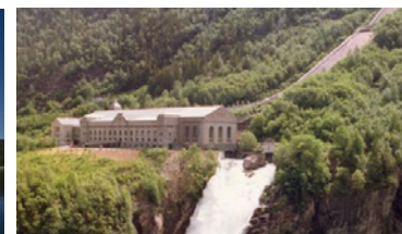
VEMORK MUSEUM Get a close encounter with Norwegian industrial - and war history with this exhibition.