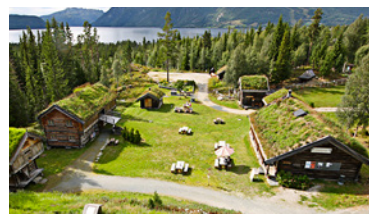
TELEMARKSTUNET Rustic courtyard with café, craftshop and bakery, open during summer and Christmas.