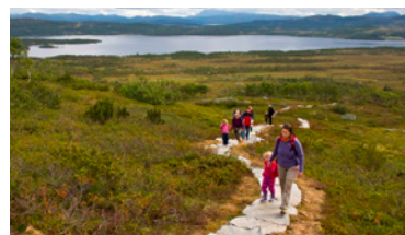
FALKERISSET Family-friendly hike in beautiful scenery with panoramic views towards Hardangervidda.