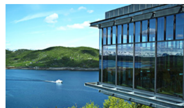
HARDANGERVIDDA NATIONAL PARK CENTRE Interactive exhibition about the nature and the wild reindeer.