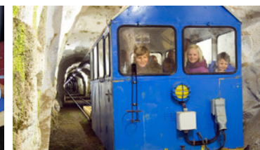
GAUSTABANEN Entering the mountain on a historical tramway 850m into the mount Gaustatoppen.