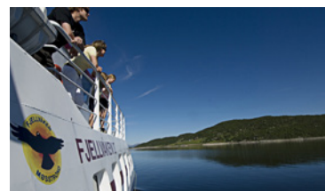
FJELLVÅKEN II Wonderful mountain cruise on lake Møsvatn, from Skinnarbu to Mogen Turisthytte.