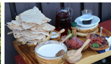
SELSTALID SETER Mountain farm serving food right at the foot of the 1883 m high Mount Gaustatoppen.