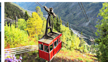
KROSSOBANEN Scandinavia's oldest and most original two-way cable-car that is still in regular traffic.